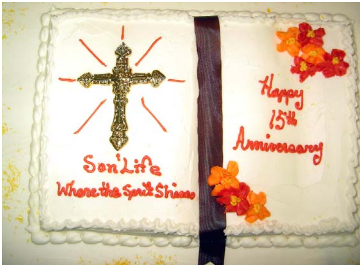
(Left) SonLife's special 15th Year Anniversary Cake...which was hastily consumed.