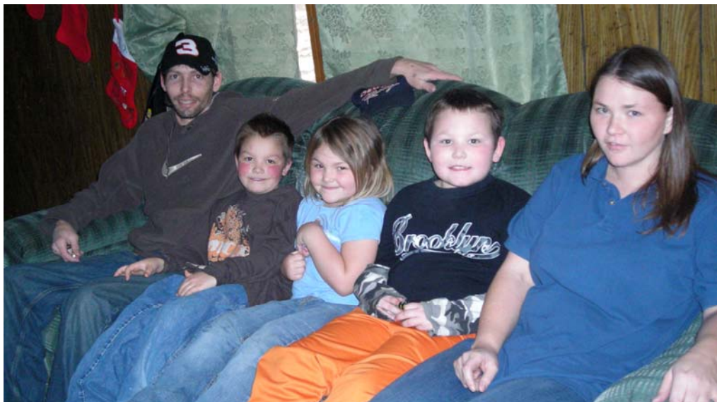
This is the family that SonLife Community Church blessed at Christmas.